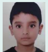
RENIN V CLASS: IV-C

Childhood is one of the most wonderful stage of our life and I believe school life is all about cherished memories. The Covid virus has affected lives worldwide but the ones who suffered the most are we- the school children. I never thought that the school would run through online mode. We are forced to remain indoors and attend classes online. Covid-19 is the reason behind the online classes. It has affected the whole world. The first day of online class was good but after a few days I started feeling that it is not the same as the physical classroom. In school, I always used to play with my friends. In comparison to all this, I feel that the physical classroom is the best. I am just hoping and praying that we tide over this pandemic at the earliest and life returns to normal for all of us and school reopens at the earliest.