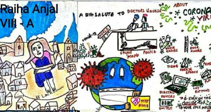
Raiha Anjal VIII - A