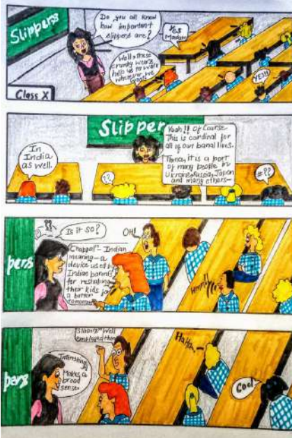
ANCEY VERMA X-B2