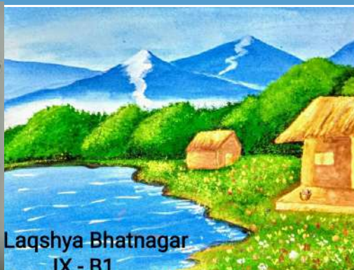
Laqshya Bhatnagar IX - B1